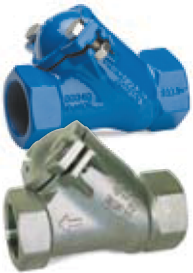
Threaded AVK Ball Check Valve with standard ball