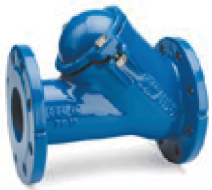
Flanged AVK Ball Check Valve with standard ball